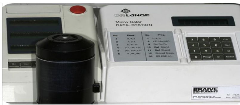
Figure (1): Dr. Lange Micro Color: color measuring device.

Afterwards, access and step-back instrumentation with K-files (Maillefer, Detrey/Denstply, Zurich, Switzerland) were performed on all teeth using 5% NaOCl as an irrigant and canals were dried thoroughly with paper points and temporization was performed with a dry cotton pellet and cavity. The teeth were randomly classified into four groups (n=10 per group). The teeth were kept in wet condition. After 1-week storage, the root canals of the teeth were filled with a sealer and gutta-percha points employing the lateral condensation technique. The sealers used were: Sealapex (Sybron-Kerr, Romulus, MI, USA) in the first group, Roth's 801 (Roth's International, Chicago, IL, USA) in the second group and AH-26 (DeTrey/Dentsply, Zurich, Switzerland) in the third group. In the fourth, no sealer was used (control group). The sealers were used according to the manufacturers' recommendations. The sealers were placed in the root canals by coating, inserting and spinning a lentulo file counter clockwise. Sealers were also placed on master cones;