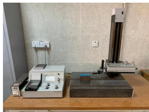
Figure (2): Profilometer for surface roughness measurements.

The surface roughness was measured by using a profilometer (Talysurf 10, R.P.I. LTD., Metrology Division) Figure (2).