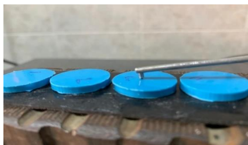
Figure (3): Samples arranged in profilometer.

surface. The surface roughness value was calculated as the mathematical average of the absolute values of the observed profile height of surface imperfections, as assessed from a mean line within a predetermined length of the specimen Figure (3). (13-16)