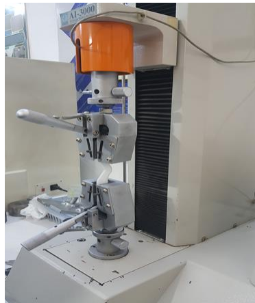
Figure 2: sample positioned symmetrically in the grips of the universal testing machine AI-3000.

strained uniformly along its length (Figure 2). the speed of clamps separation was 500 \pm 50 mm/min until the sample was ruptured.